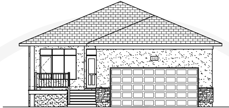
ARTIST'S REPRESENTATION - EXTERIOR MAY VARY